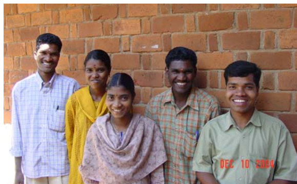
Some of the Trainees

The Hospital: The renovations are over and our hospital has a bright airy feel. Last year we saw over 10,000 Outpatients, 53% tribals. Specialty clinics in ENT, General Medicine, Geriatrics and Dentistry, besides Surgery, Obstetrics & Gynecology continue to be held.